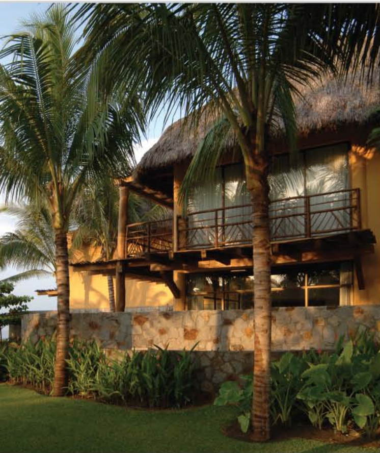
Acapulco Diamante, Acapulco, Mexico.